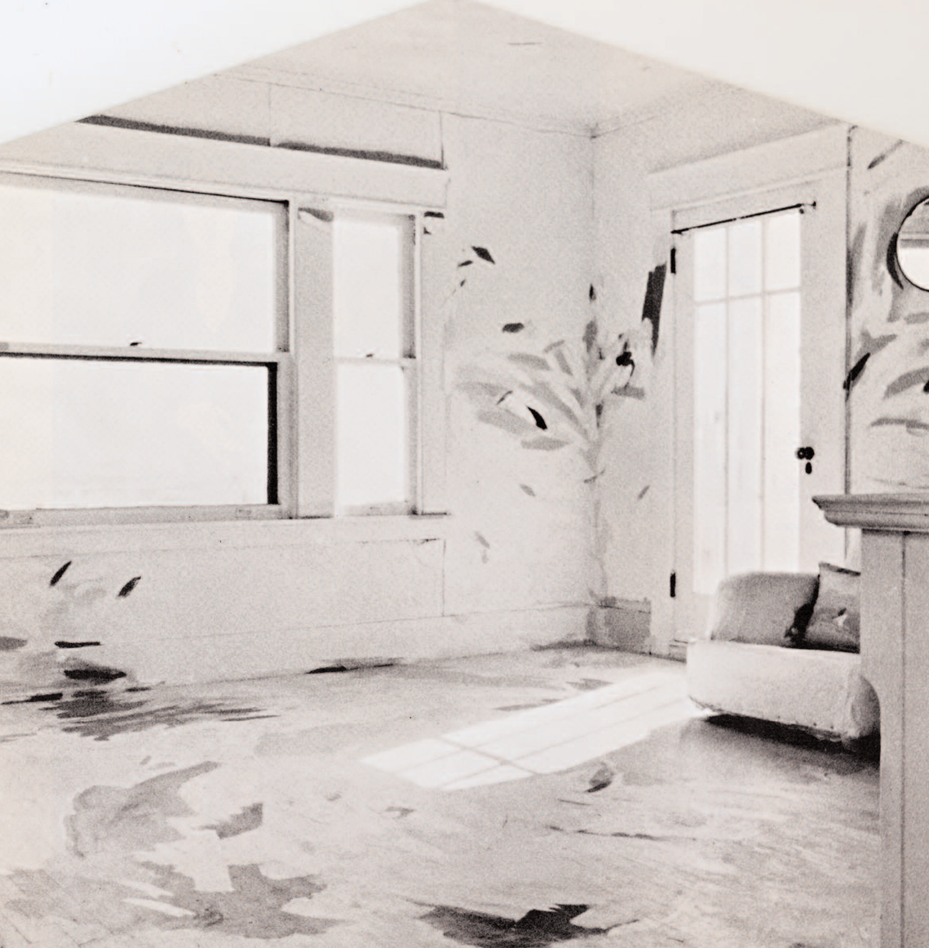
Robin Mitchell, Painted Room . 1972. Installation. Womanhouse , Los Angeles.