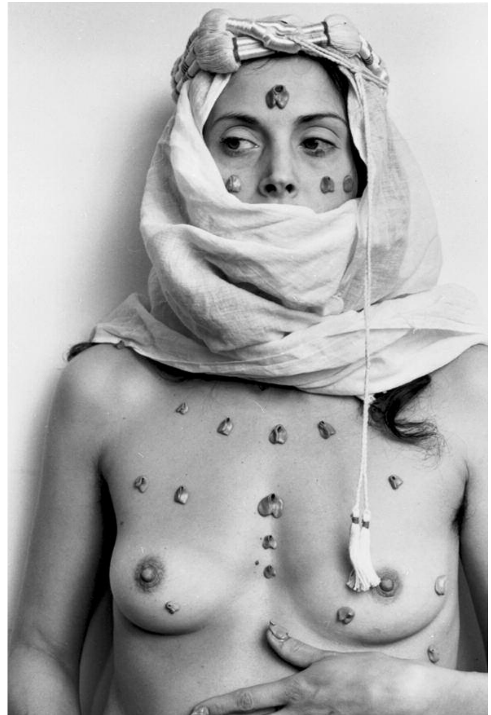
Hannah Wilke, S.O.S. Starification Objects Series (Veil), 1974–75. Gelatin silver print, 40" x 28". Hannah Wilke Collection & Archive, Los Angeles.

TW: So often when I encounter people who have been born in the last two or three decades, inevitably they accept how things are right now and they don't understand the enormous shift that occurred to enable them to be how they are now. So I'm wondering if there is anything else that you would want to say to explain to such a person that shift of perception.