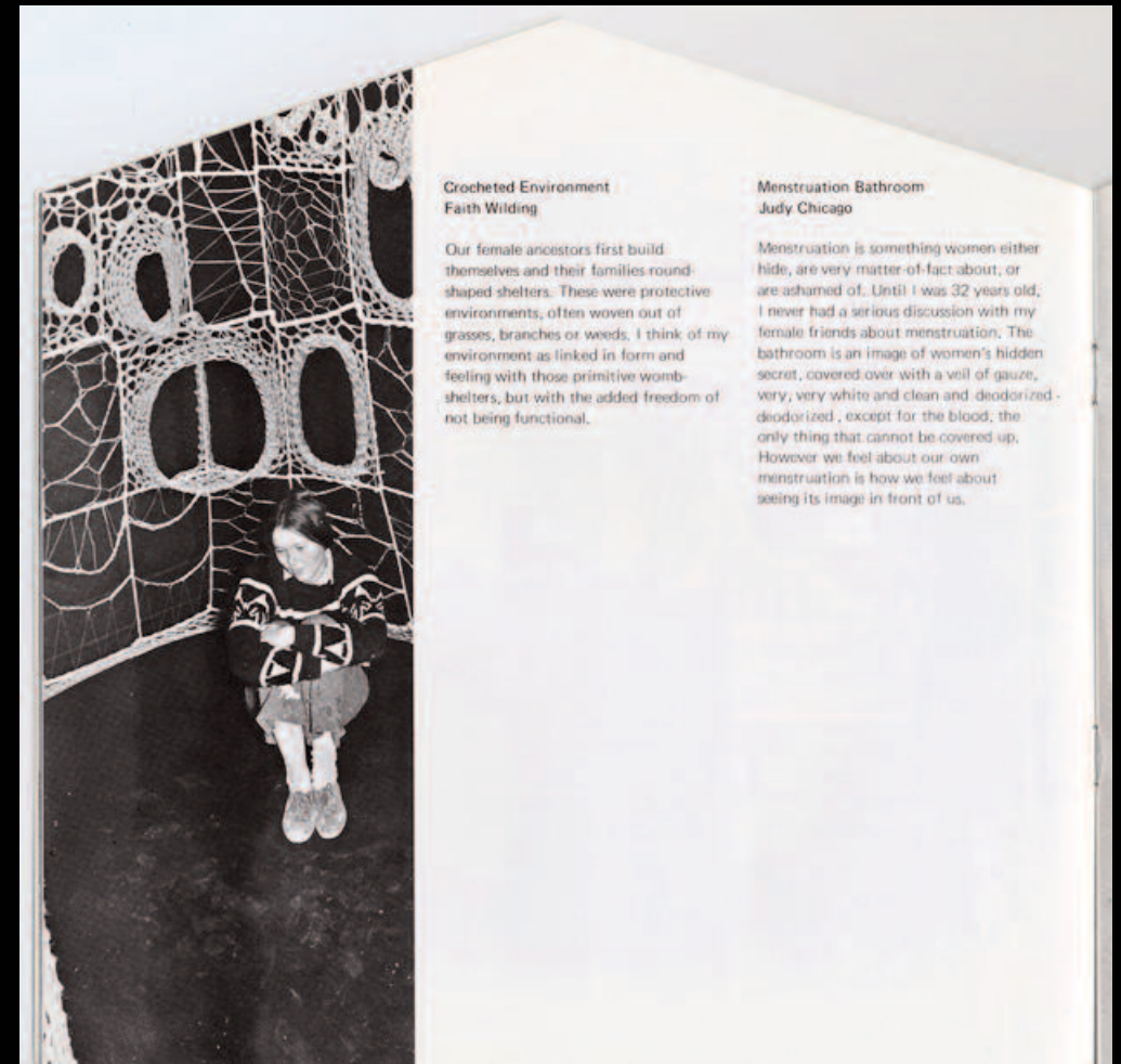
Faith Wilding, Crocheted Environment (Womb Room) 1972. Installation, Womanhouse , Los Angeles.

TW: We've talked about how when you were a child there was really nothing to look at and so you didn't have an awareness of looking. Then, your visual sensibility opened up in a profound way. When you began to look for women and to read for women's