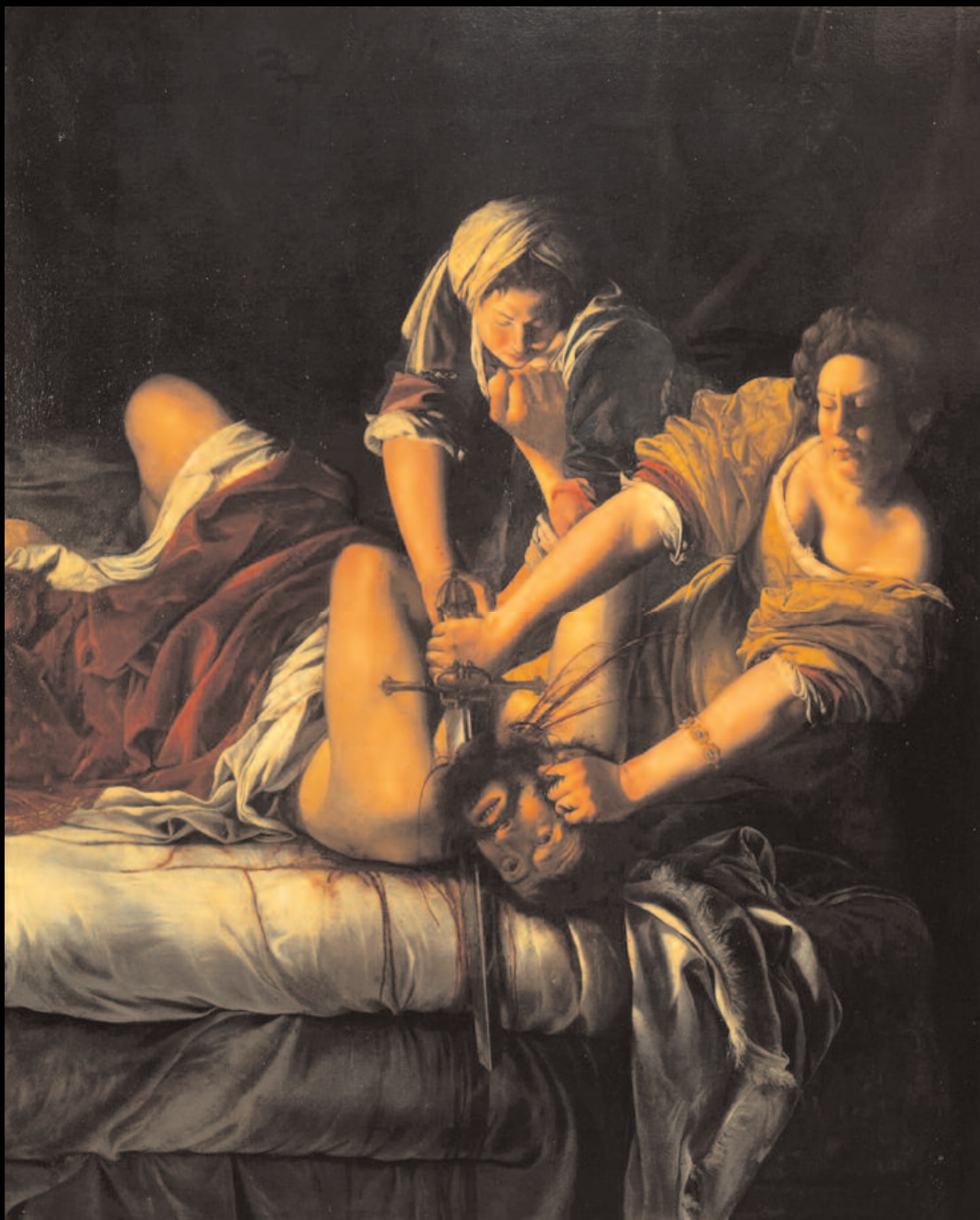
Artemisia Gentileschi (1597–c.1651), Judith and Holofernes , ca. 1620. Oil on canvas, 78 3/4" x 64". Uffizi, Florence, Italy.